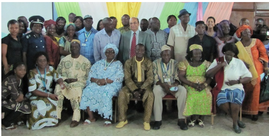
Launch of the referral protocol. At the center, the Honorable Minister of Social Welfare, Gender and Children's Affairs

The development of the referral protocol was coordinated by the National Committee on Gender-based Violence (NAC-GBV) which was established in November 2006. It was formed to avoid duplication of efforts, to address prevention and response to GBV in a coordinated manner and to develop sustainable ways of introducing and integrating GBV services and activities into the public health system and other national structures. NAC-GBV is hosted within the MSWGCA and is chaired by its Minister and co-chaired by the Assistant Inspector General of the Sierra Leone Police in charge of Crime Services (AIG/CID). The committee membership includes government agencies, service providers and civil society organizations. There are regional Gender-Based Violence Committees in the North, South and Eastern Provinces of the country. The GBV Committees comprise of government institutions, the UN system, and international and national non-governmental organisations working in prevention and response to gender-based violence across the country.