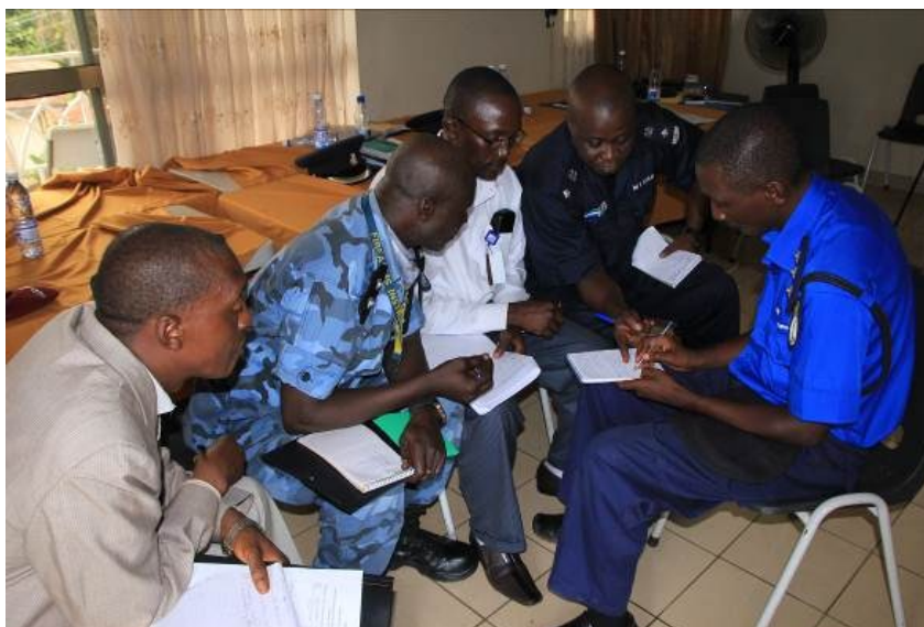
Participants discuss on the basic concepts a police recruit should master

The SLP has committed to extending basic recruit training from three to six months, starting in 2012, as part of its Strategic Plan 2012-2014. This will require a revision of both the training content and the methodology used. The revision will focus on building core competencies and promoting appropriate attitudes and practices with an increased time allocation. This will provide an opportunity to explore how principles of human rights and community policing can be better integrated throughout the curriculum, and to introduce expanded modules on special issues relating