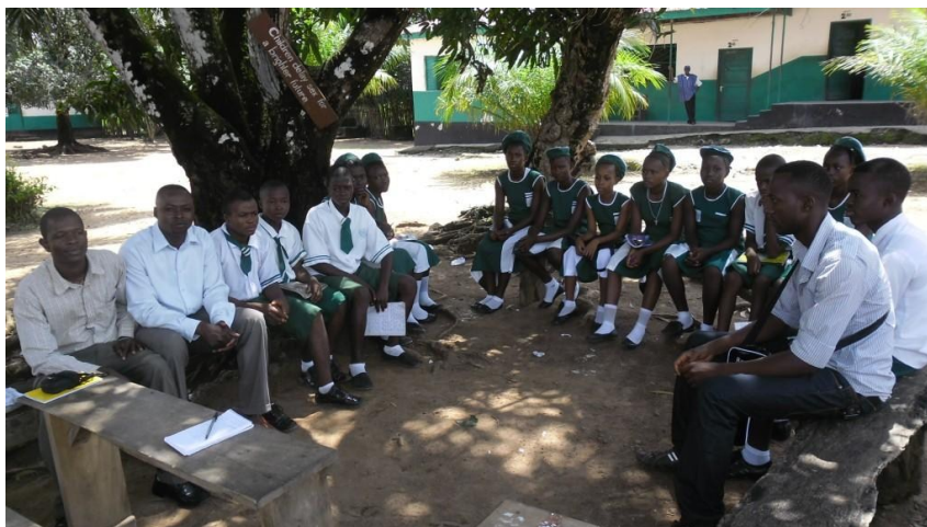
Pupils of the Binkolo Secondary School, Bombali District, attending an outreach activity

Since late 2009 UNDP has supported CSOs nationwide through SGBV Grants in order to raise awareness of SGBV, promote community level prevention mechanisms and provide legal and practical support to victims. The support provided to CSOs through these SGBV Grants falls directly within the first 3 outputs of SiLNAP (dealing with the prevention, protection and prosecution of SGBV cases) and is a vital component of the Government's strategy to eliminate violence against women.