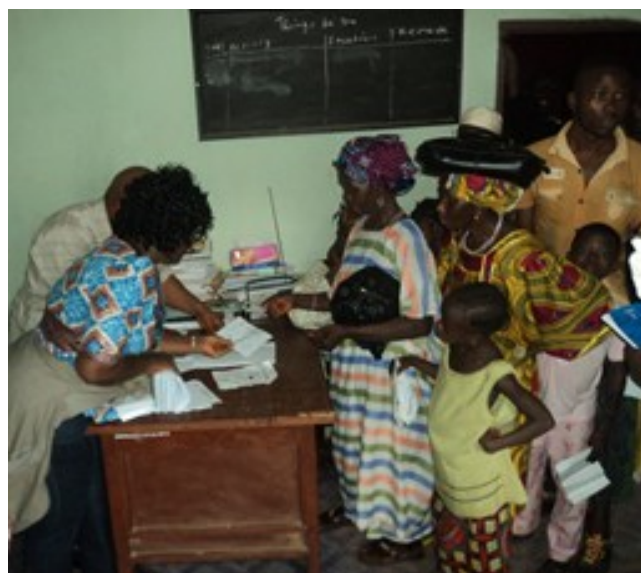
NACSA staff issuing payment slips to war victims in Port Loko

social position. Failure to provide reparations to the remaining 30% of registered war victims would have had a negative impact for the peace and reconciliation as the conditions of the remaining victims were in stark contrast to the other victims who had received reparations, or to the former war combatants who had benefited from the DDR process. This could fuel the feeling of grudge among the unpaid war victims and would erode the gains that have been made by the reparations and other reconciliation processes. It is against this back drop that the PBF provided in 2012 through the IOM $ 1,100,000 to reach out to all the remaining war victims. The start of the final payment round came one day before 26 June which is the UN International Day in Support to Victims of Torture.