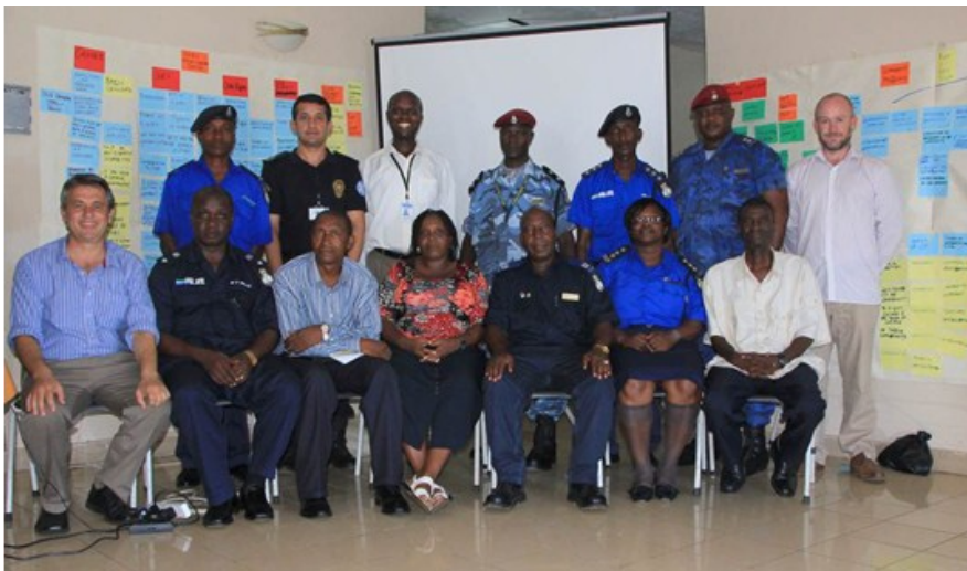
The participants in the first workshop to review the existing curriculum at Kona Lodge

Programme 2 partners and ASJP promote a revision of the training curriculum of the Police Training School to better include human rights