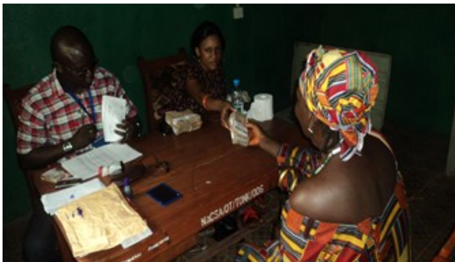
War victim receiving cash reparation payment in Magburaka, Tonkolili District

Ensuring access to justice, redress and assistance to victims of conflict represents integral part of post-conflict peace consolidation and stabilization efforts, as well as precondition for addressing past or prevent future forced displacement. In Sierra Leone, the signing of the Lomé Peace Agreement in 1999 in principle heralded the end of the 10 year conflict in the country. In a bid to make peace more permanent, the Sierra Leone Government established a Truth and Reconciliation Commission (TRC), as provided for in Article VI paragraph 2(six) of the Peace Agreement, to address the causes and victims of the war. Consequent upon its mandate, the TRC report recommended the establishment of a Reparations Program to be implemented by the National Commission for Social Action (NACSA). This programme to a very large extent was to kick-start the process of addressing the needs of the victims irrespective of the type of harm they suffered and meet the obligations of the Government, as specified in the Lomé Peace Accord and recommended in TRC Report.