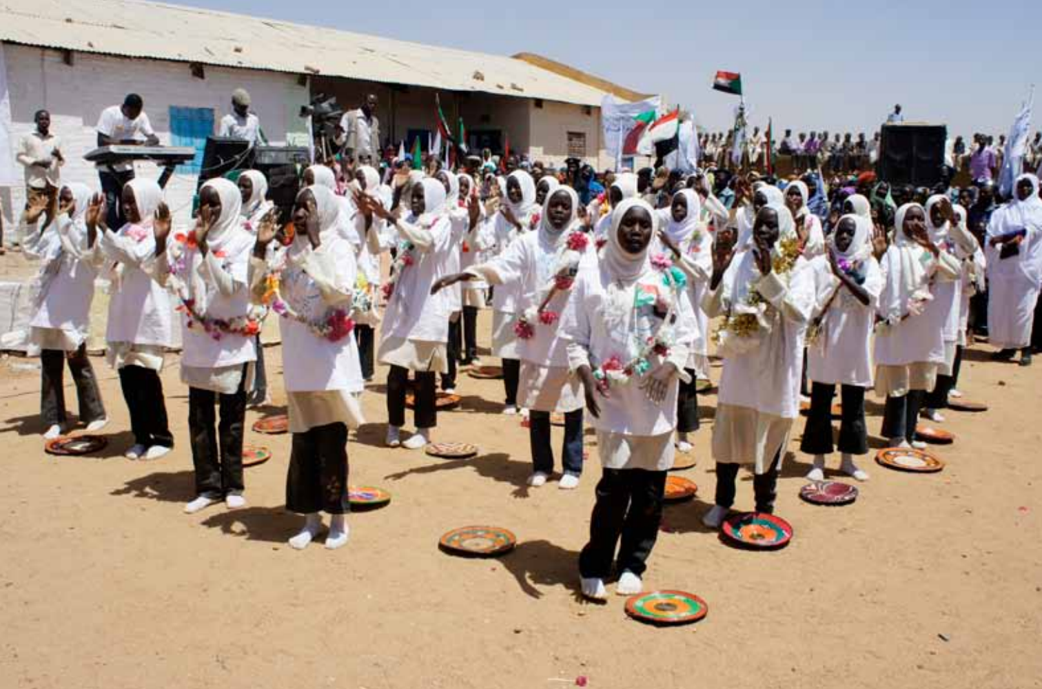
left. Observing International Women's Day - Solidarity march in El Fasher