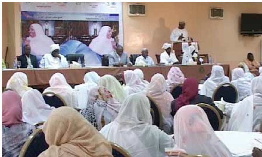
UNAMID JSR Gambari addresses the women legislators during the launch