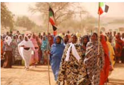
The women of Zalingei

The eighth of March 2011, the one hundredth anniversary of International Women's Day, was a landmark day in Kabkabiya, North Darfur. It celebrated the special date for the very first time when residents of the town and neighbouring villages joined millions of people around the world to recognize the achievements of women.